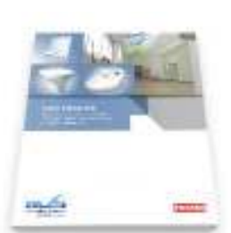
DVS Safe Ensuites