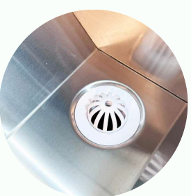
2" (50mm) Domed Waste