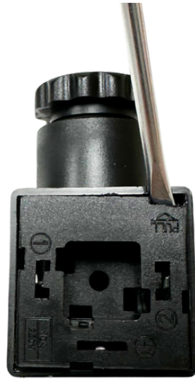
Lever open plug face with Small Screwdriver