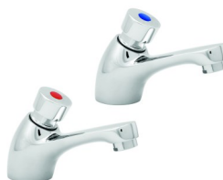
TAP-C Timed Flow Push Taps Sold as Singles or Pairs (22/28mm Drill Holes)