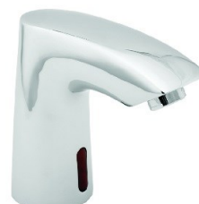
SEN-1D Auto Sensor Tap (35mm Drill Hole)