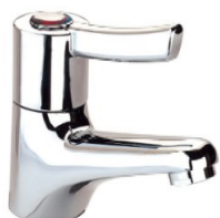
TAP-D Sequential Mixer Tap (35mm Drill Hole)